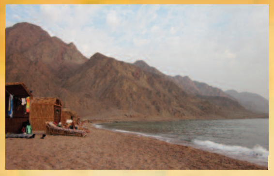
Teresa Barredo reminisces the "Best place to sleep" during her exchange in Egypt

Participation Costs (tuition and/ or registration fees, additional library, student unions, laboratory consumable costs, permit residence, language courses costs) up to maximum of 3,000 euros.